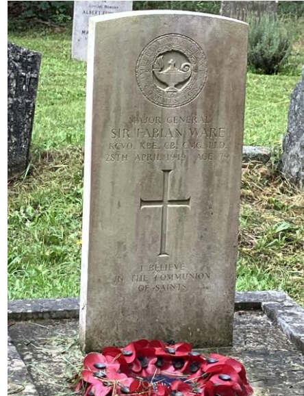
His grave at Amberley Churchyard